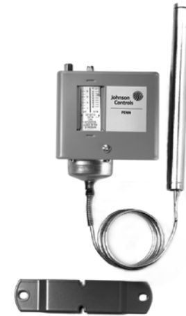
A72AA-3 Temperature Control